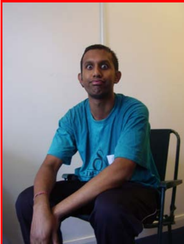
Fart came out the wrong way