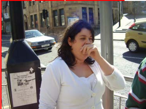
yep...that was Shrek the Third was like